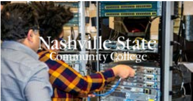
Do not place logo on a busy background image.