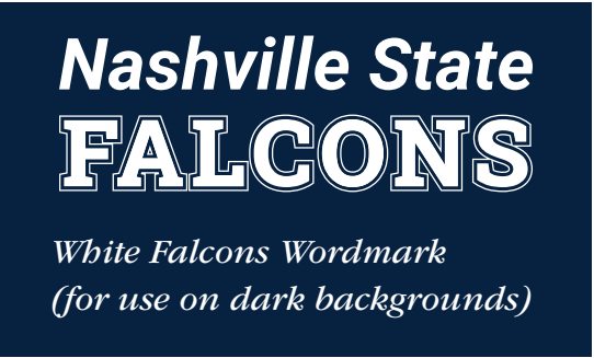
White Falcons Wordmark (for use on dark backgrounds)