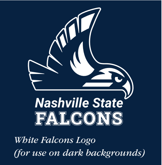
White Falcons Logo (for use on dark backgrounds)