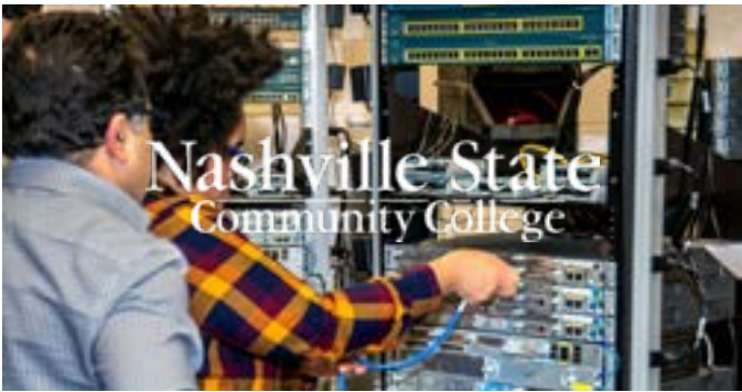
Do not place logo on a busy background image.